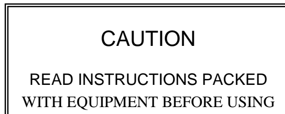
FIGURE 2. Caution plate .

5.3.6 Schematic, wiring, and cable diagram . When these are provided, they shall be in the form of labels or direct marking on a suitable surface of the item.